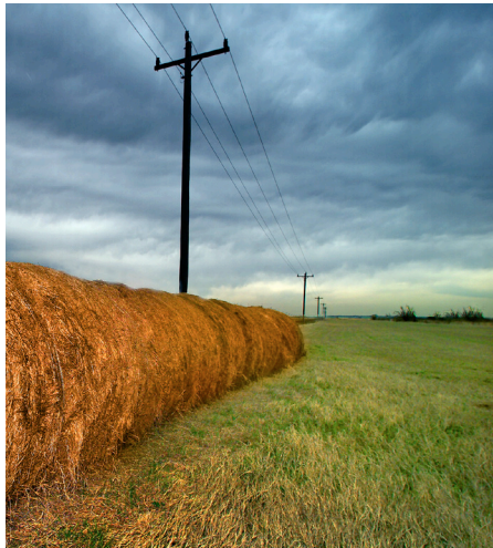
Electric cooperatives own and maintain roughly 65,000 miles, or 6 percent, of the nation's transmission lines and 2.5 million miles, or 42 percent, of its distribution lines.

The tricky thing about electricity is that it must be used, or moved to where it can be used, the second it's produced; it generally can't be stored like water or gas. What's more, electricity moves at the speed of light along the path of least resistance. This basic principle calls for a carefully monitored, intricate system to move it 24 hours a day.