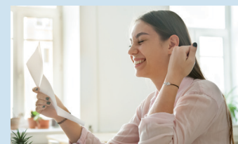
PAGE 4 Operation Round Up Prize Winners, Bill Credit Winners