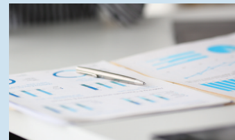
PAGE 2 2021 Cooperative Annual Meeting Slate, Board of Director Candidate Bios

We will certainly miss seeing all our members in person, but hope you'll join us to see how we powered on in 2020, conduct important business and how we plan to continue our mission of providing the power for our member-owners to enhance their quality of life.