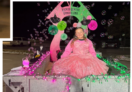
Whitewater Valley REMC won "Most Unique Float" at the parade for their Wicked-inspired float.